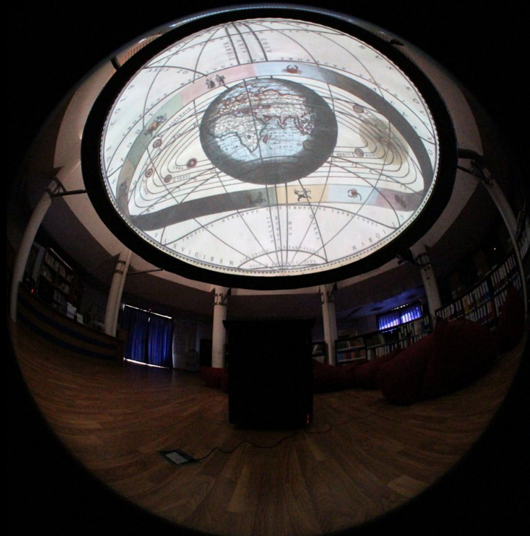
Images: Emerald-LITE dome, real projections