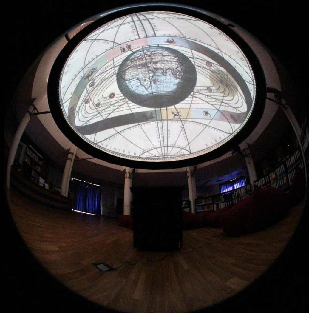
Images: Fabric-LITE dome, real projection